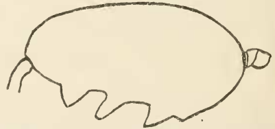
FIG. 2.— PODAGRION ECHTHRUS . HIND FEMUR OF MALE.